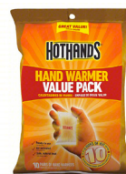
Chemical Foot & Hand Warmers