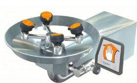
Emergency Eyewash Equipment