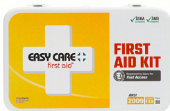
First Aid Kits