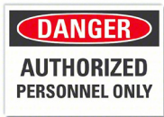
Safety & Facility Identification Signs